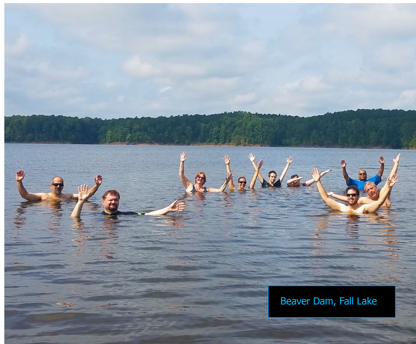
Beaver Dam, Fall Lake