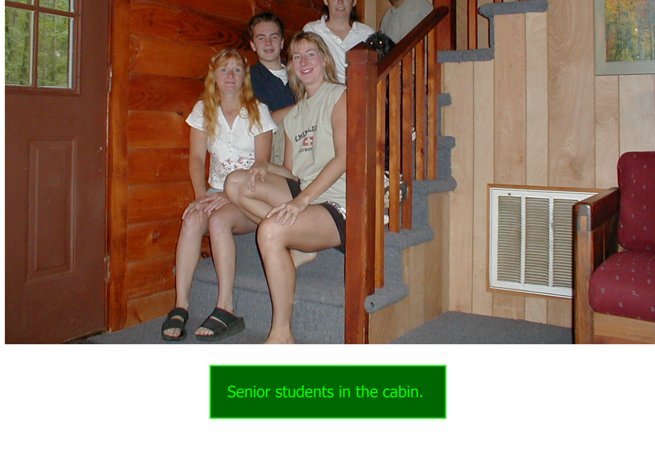
Senior students in the cabin.